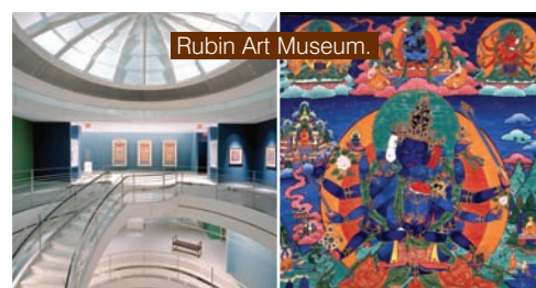
Rubin Art Museum.