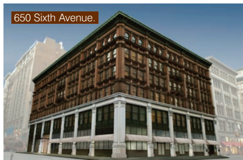
650 Sixth Avenue.

With Quintessentially's concierge service, a wine cellar, and a roof deck, these white-on-white apartments are the soul of clean living. 650 Sixth Avenue ; 650sixth.com .